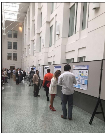
This year's poster session at the CAFPA 2019 Fall Meeting included seven posters spanning diverse topic areas and several institutions.

were highly educational and facilitated thoughtful discussions. Specific presentations showcased at this meeting greatly contributed to achieving CAFPA's mission to provide expert speakers, information on the latest scientific developments and new perspectives to food safety and microbiology professionals and the broader technical community.