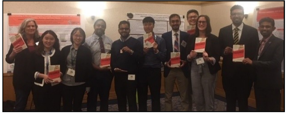
Student presenters at the WAFP’s Annual Conference were honored at the Student Poster Showcase: Science & Cocktails Event before the Affiliate Dinner & Awards Banquet held on September 19.